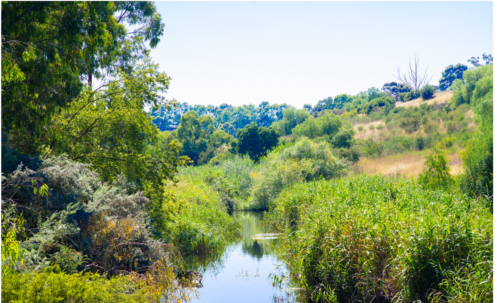
Pictured: The beautiful Merri Creek