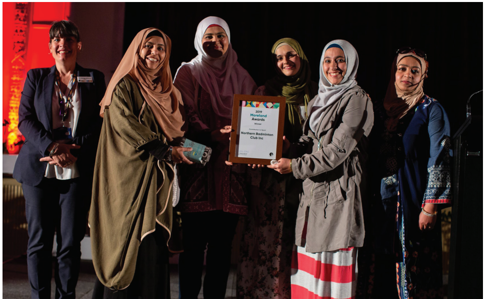
Above: The Northern Badminton Club with Moreland award