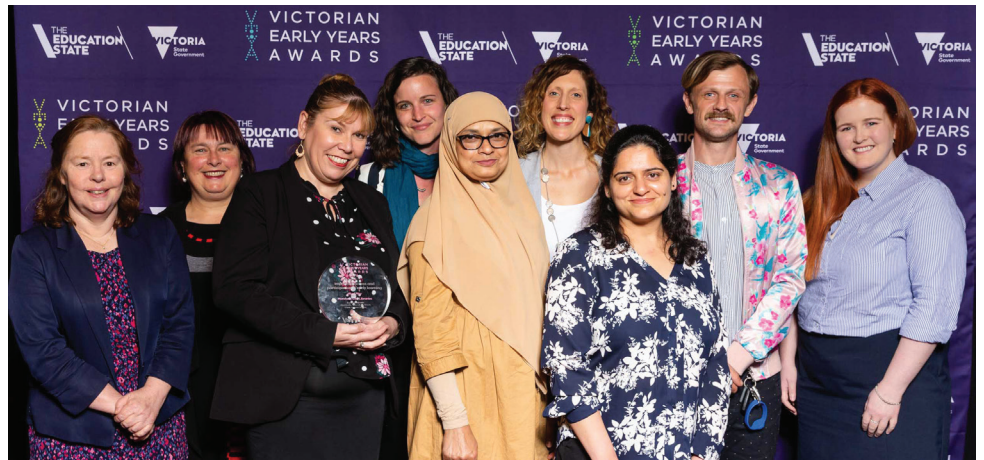
Above: Word Play team at awards