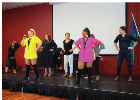
Above: The Merindas

The carers enjoyed a lunch, connected with each other and had the chance to dance along with The Merindas.