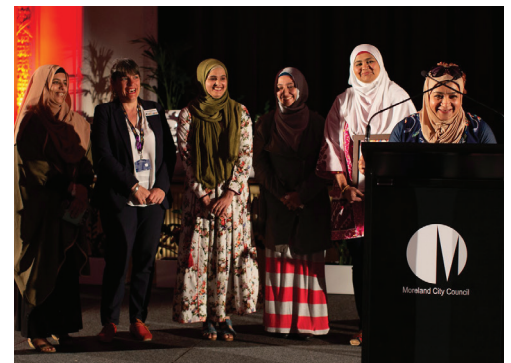
Above: The Northern Badminton Club receiving award.