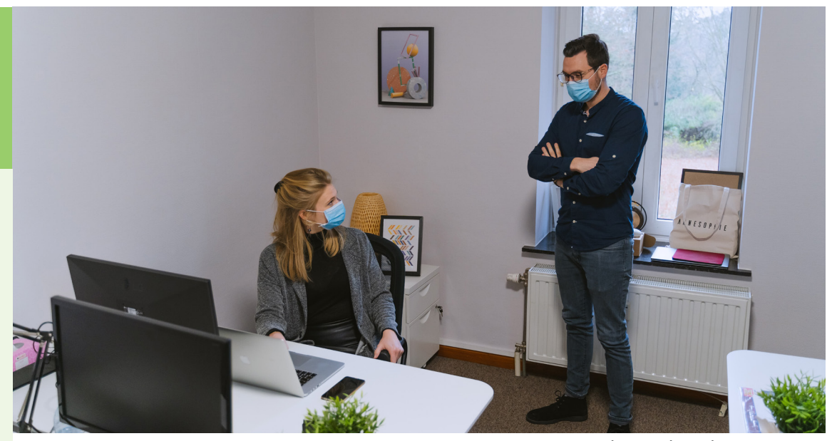
Above: photo by Maxime