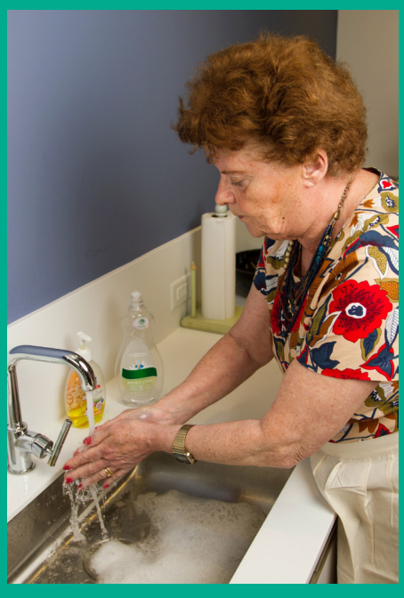
Above: photo by National Cancer Institute

In early 2020, a casual staff member of the Supported Residential Service Glenville Lodge team tested positive for COVID-19.